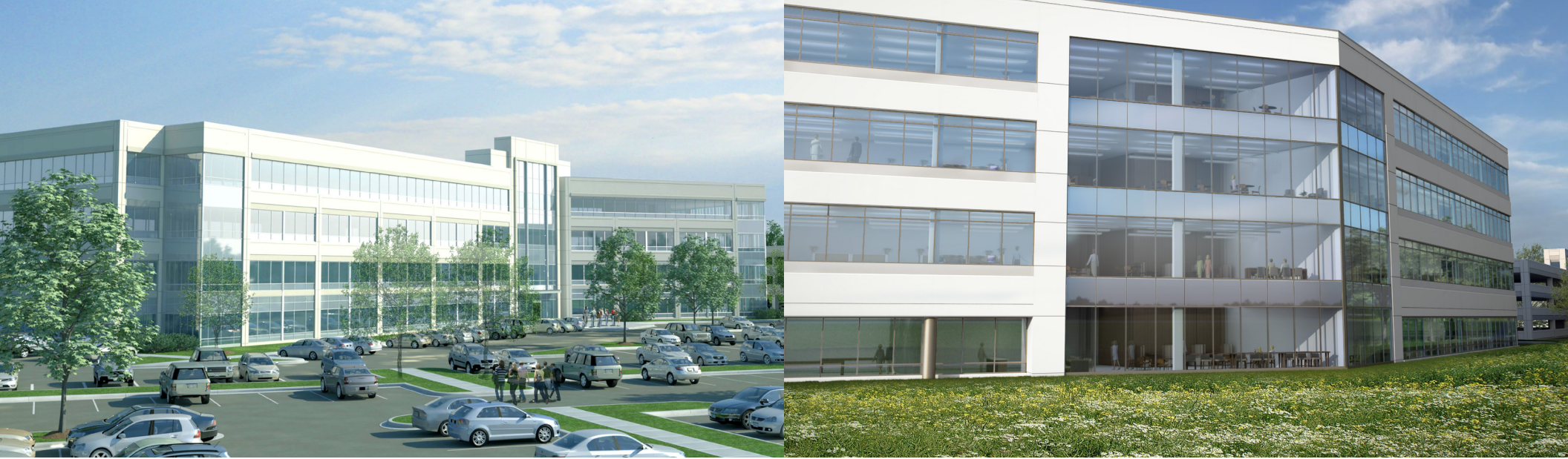
Build-to-Suit Options at PrincetonSouth Corporate Center