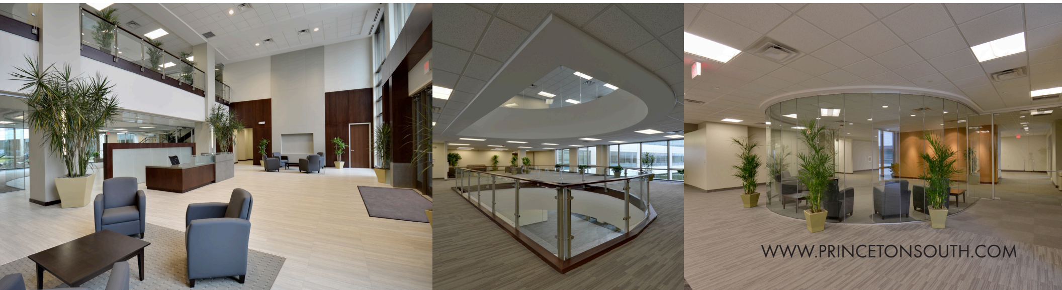
Church & Dwight's Headquarters at PrincetonSouth Corporate Center