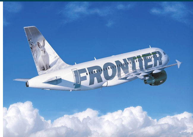
Frontier Airlines at Trenton Mercer